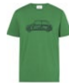
MINI CAR PRINT T-SHIRT MEN'S

100% cotton Black S–XXXL 80 14 2463218–23