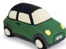
MINI KNITTED CAR

90% cotton, 10% polyester Grey/White 80 45 2465960 27 x 16 x 23 cm