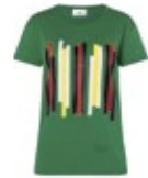
MINI STRIPE T-SHIRT WOMEN'S

100% cotton White XXS–XL 80 14 2463182–87