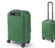
MINI CABIN TROLLEY

70% cotton, 30% nylon Black/British Green S–XXXL 80 14 2463236–41