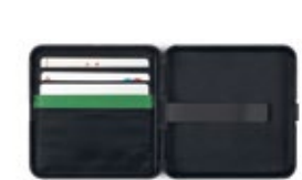
MINI HARD CASE WALLET

Zinc cast, cowhide leather base Multicoloured 80 27 2465936 5.5 × 9 × 0.4 cm