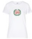
MINI VINTAGE LOGO T-SHIRT WOMEN'S

100% cotton White XXS–XL 80 14 2463182–87