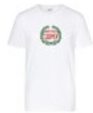
MINI VINTAGE LOGO T-SHIRT MEN'S

Shell: 100% polycarbonate Lining: 100% polyester British Green 80 22 2463265 71 × 48.5 × 27.4 cm Capacity: 76 l volume