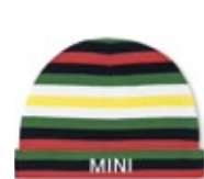
MINI STRIPED BABY GIFT SET

100% cotton Multicoloured 98–128 80 14 2463248–53