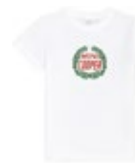
MINI VINTAGE LOGO T-SHIRT KIDS

65% cotton, 35% polyester White 80 16 2463255 Black 80 16 2463256