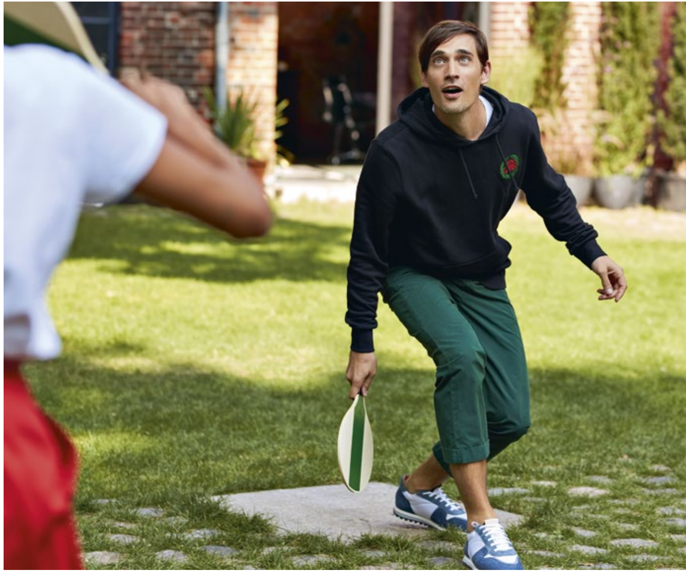
Left: Beach Tennis, Vintage Logo Sweatshirt Men's Right: Football, Stripe T-Shirt Men's