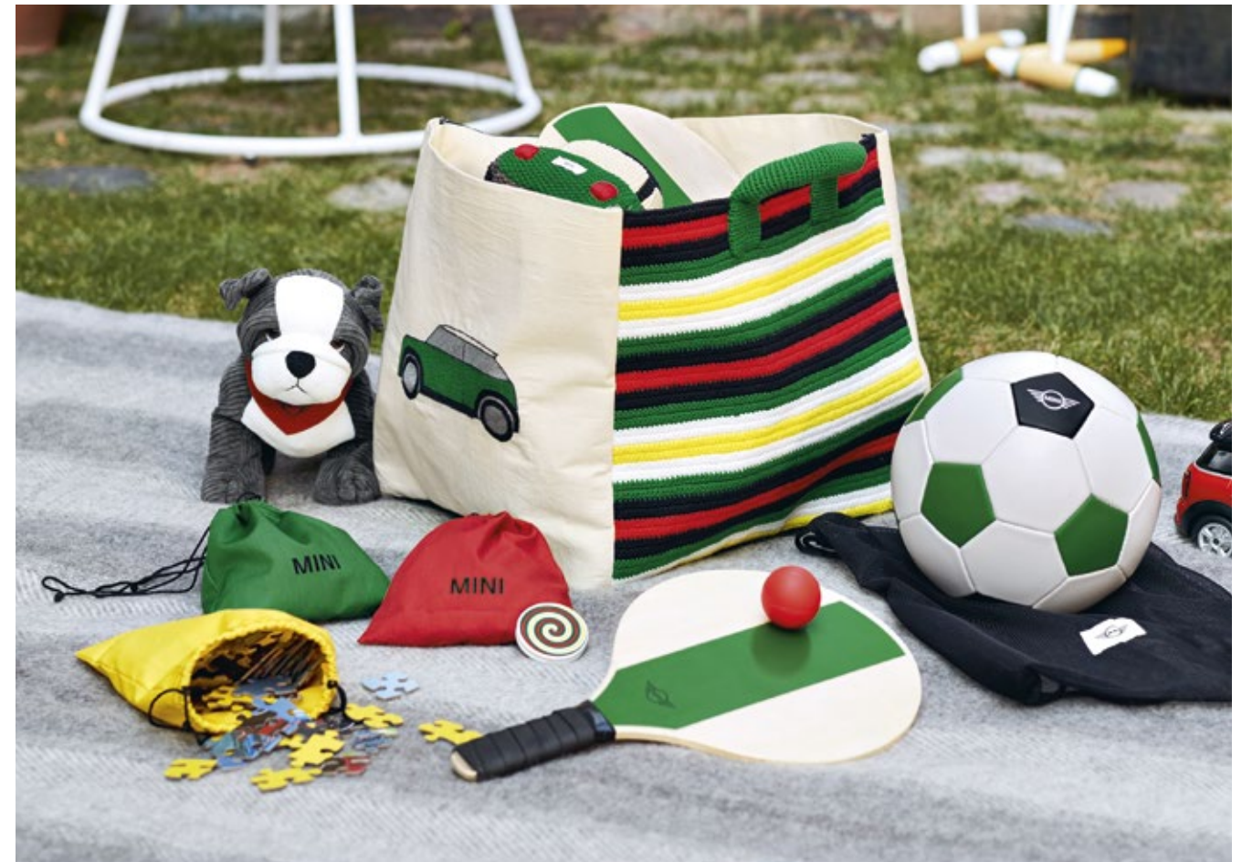
Left: Knitted Car, Striped Sweatshirt Kids, Football, Striped Toybox Right: Puzzle Set, Bulldog 2.0, Striped Yo-Yo, Striped Toybox, Knitted Car, Beach Tennis, Football