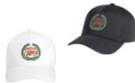
MINI VINTAGE LOGO CAP

100% fast dry polyester Multicoloured 80 23 2465950 Length: 82.2 cm Diameter: 99.5 cm Handle: 13.5 × 3.3 cm