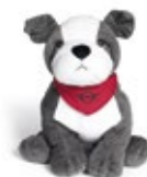
MINI BULLDOG 2.0

Plastics Multicoloured 80 45 2465957 5.5 x 5.5 x 0.8 cm