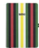
MINI STRIPED NOTEBOOK

Cover: cloth-bound bookbinder fibreboard Paper: FSC-certified Multicoloured 80 24 2465938 21.5 × 15 × 2 cm