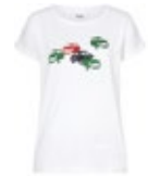
MINI CAR PRINT T-SHIRT WOMEN'S

100% cotton British Green XXS–XL 80 14 2463188–93