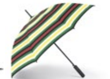
MINI STRIPED WALKING STICK UMBRELLA

100% fast dry polyester Multicoloured 80 23 2465949 Folded: 27 × 6 cm Diameter: 98 cm Handle: 5 × 4 cm