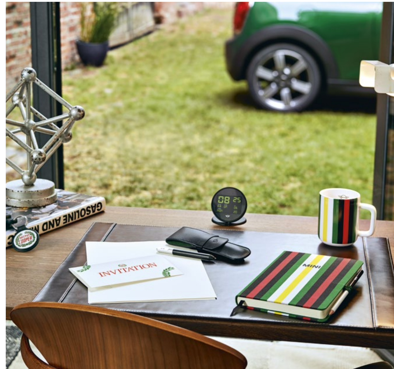
Vintage Logo Keyring, Leather Pencil Case, Alarm Clock, Striped Notebook, Striped Cup

100% cotton Multicoloured 80 45 2465959 35 x 35 x 40 cm