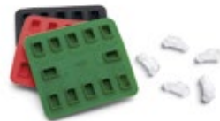
MINI ICE CUBE TRAYS

100% BPA-free polymer British Green, Black, Coral 80 28 2465943-45 8 x 8 x 19.4 cm Capacity: 0.7 l