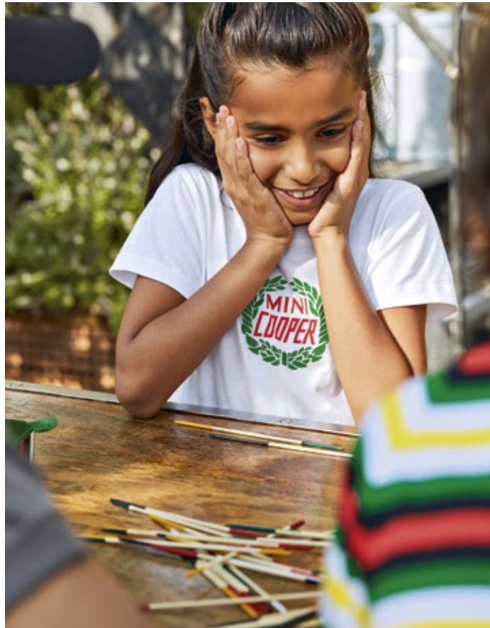
Left: Pick-Up Sticks, Vintage Logo T-Shirt Kids Right: Striped Lunch Box, Striped Sweatshirt Kids, Puzzle Set, Vintage Logo T-Shirt Kids