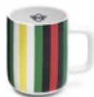
MINI STRIPED CUP

100% BPA-free polymer British Green 80 28 2465941 8 x 8 x 24.8 cm Capacity: 0.7 l