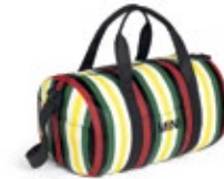
MINI STRIPED DUFFLE BAG

70% cotton, 30% nylon Black/British Green XXS–XL 80 14 2463206–11