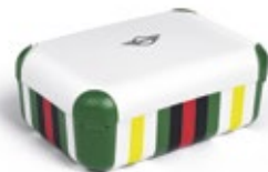
MINI STRIPED LUNCH BOX

Stoneware Multicoloured 80 28 2465939 7.6 x 7.6 x 10 cm Capacity: 0.35 l