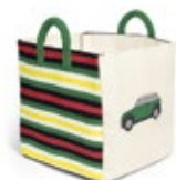
MINI STRIPED TOYBOX

95% cotton, 3% polyester, 2% viscose British Green 80 45 2465958 26 x 14 x 13 cm