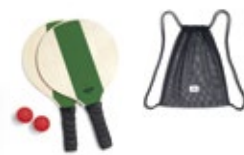
MINI BEACH TENNIS

Polypropylene Multicoloured 80 28 2465940 16 x 11 x 6 cm