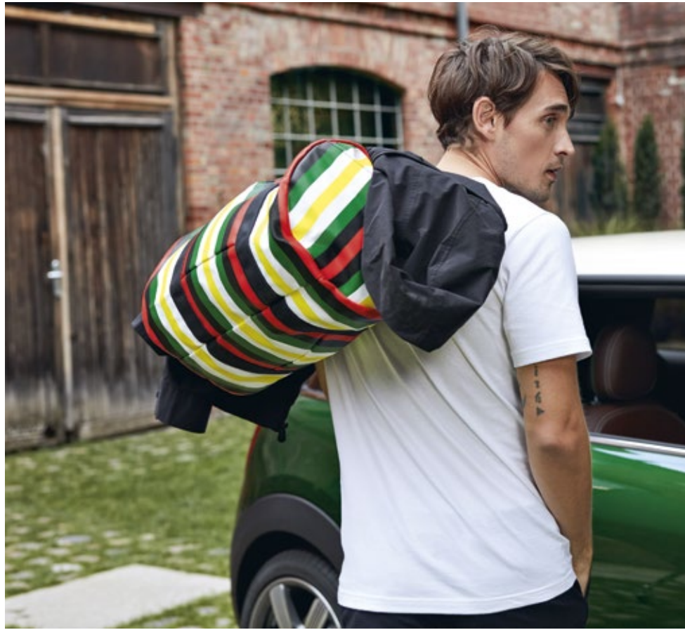
Left: Striped Duffel Bag, Two-Tone Jacket Men's Right: Striped Duffel Bag, Cabin Trolley, Bulldog 2.0, Striped Shopper, Striped Belt Bag, Tonal Colour Block Backpack