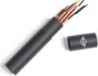
MINI PICK-UP STICKS

Puzzles: cardboard Bags: 100% cotton Multicoloured 80 45 2465956 Each puzzle: 36 x 26 cm