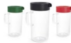
MINI COLOUR BLOCK ICE TEA JUG

100% BPA-free polymer British Green, Black, Coral 80 23 2465946-48 12.6 x 18.3 x 24.7 cm Capacity: 2 l