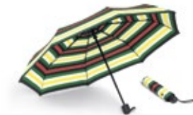
MINI STRIPED FOLDABLE UMBRELLA

100% waxed cotton British Green 80 21 2463263 8.5 × 8.5 × 0.4 cm