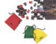
MINI PUZZLE SET

Ball: PVC Mesh backpack: 100% polyester White/British Green/Black 80 45 2465955 Circumference: 68 cm