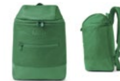
MINI TONAL COLOUR BLOCK BACKPACK

Shell: 100% polycarbonate Lining: 100% polyester British Green 80 22 2463264 55 × 35.5 × 23 cm Capacity: 36 l volume