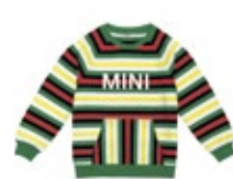
MINI STRIPED SWEATSHIRT KIDS

100% cotton with UV-protection finish White 98–128 80 14 2463242–47