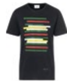
MINI STRIPE T-SHIRT MEN'S

100% cotton White S–XXXL 80 14 2463212–17